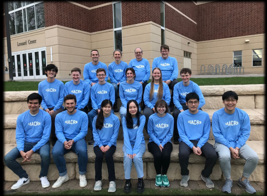
Macalester College students in spring 2023 advanced topics class that worked exclusively on RLMT DATA