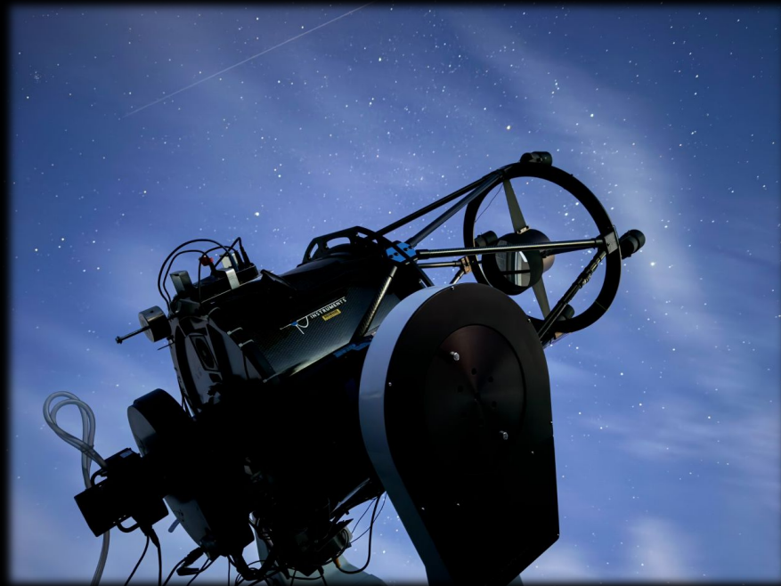
The Robert L. Mutel Telescope ( RLMT )