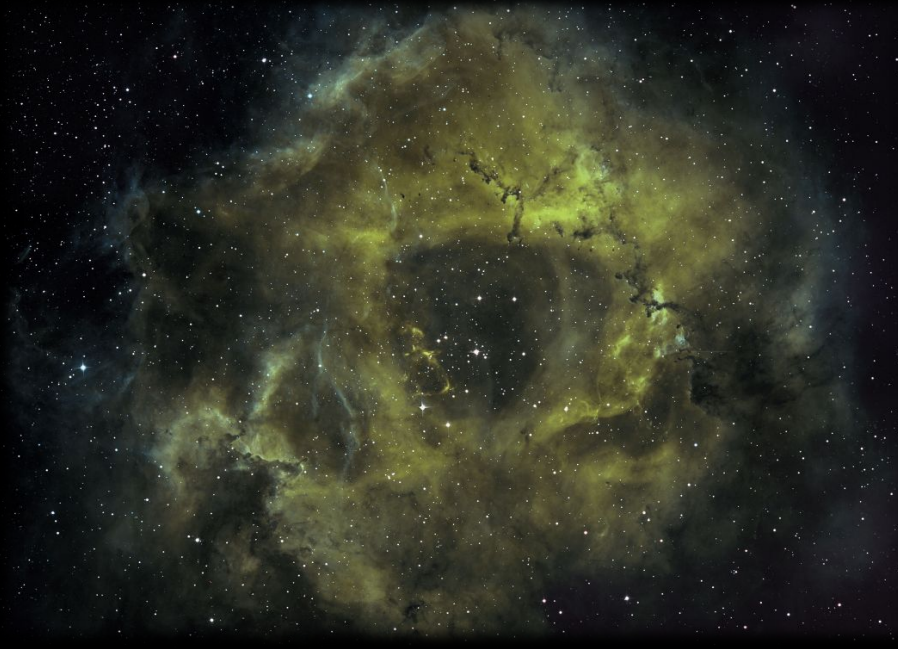
RLMT image of the Rosette Nebula (Iowa)