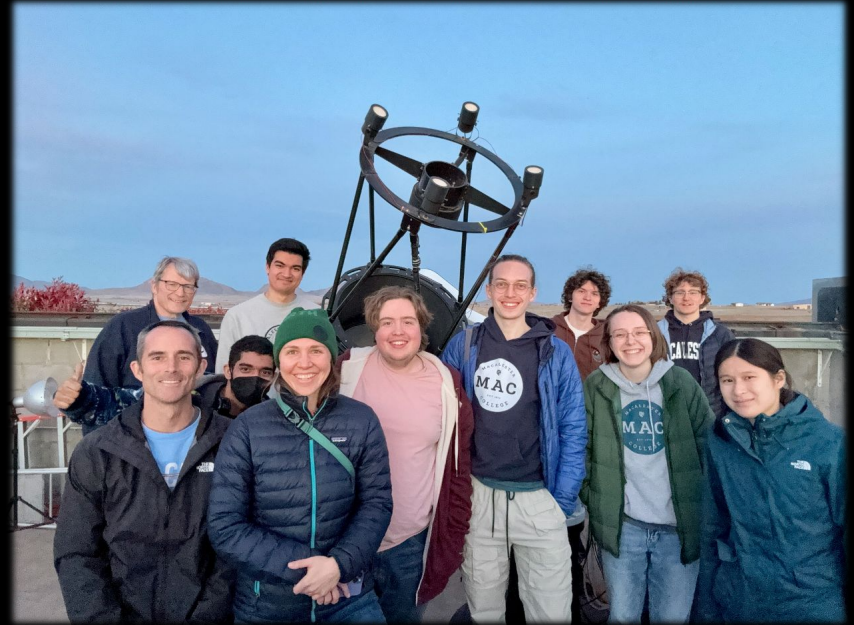
Macalester College community members at the RLMT in March 2024