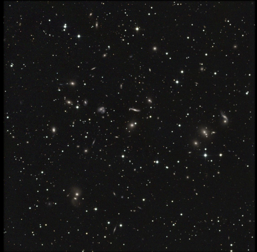
RLMT color image of the NGC 6047 galaxy group (Knox)